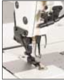
Needle thread clamp mechanism and sliding presser foot