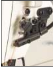
Needle thread draw-out mechanism

The machine comes with a silicon oil lubricating unit, thread spreading mechanism and thread trimming mechanism which trims the thread without fail, thereby consistently ensuring beautifully-finished seams for light- to medium-weight materials. The appearance of the machine is restyled, and it is now colored in a refreshing urban white.